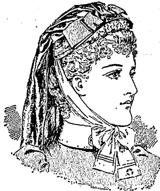
The "St. Bride's" Bonnet. Made of fine Straw with Lace and ruching, and trimmed with Ribbon, and long Silk Gossamer Fall. In black and colours, 12/6 each. Without Fall, 9/6; also The "St. Clare" Bonnet. 6/11 complete.