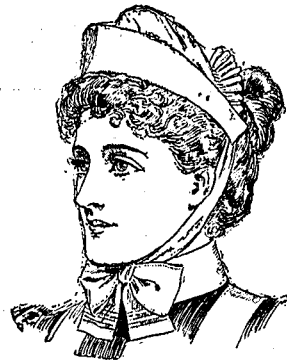
The New "Sister Dora" Cap. Made of washing Cambric, with draw strings. Can be washed as easily as a handkerchief. 1/-. Without strings, 10½d.