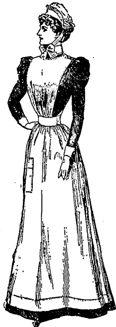
The "Rena" Apron. Made of linen finished Cloth lock-stitch throughout, 2/6 each. In two sizes, 36 in. & 39 in. from waist to hem.

PATTERNS FREE OF THE New Washing Materials for Nurses' Dresses, INCLUDING REGATTA CLOTHS, HECTOR DRILLS, HALIFAX CLOTH, ATTALEA TWILLS, &c.